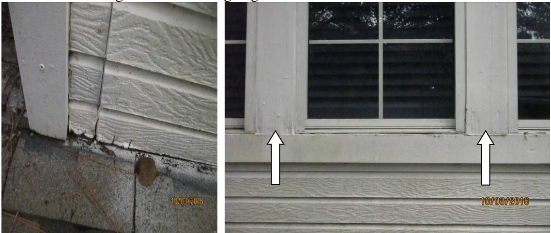
Nail holes, siding and window trim between pool pumps and nook.

Siding and trim above garage on second level