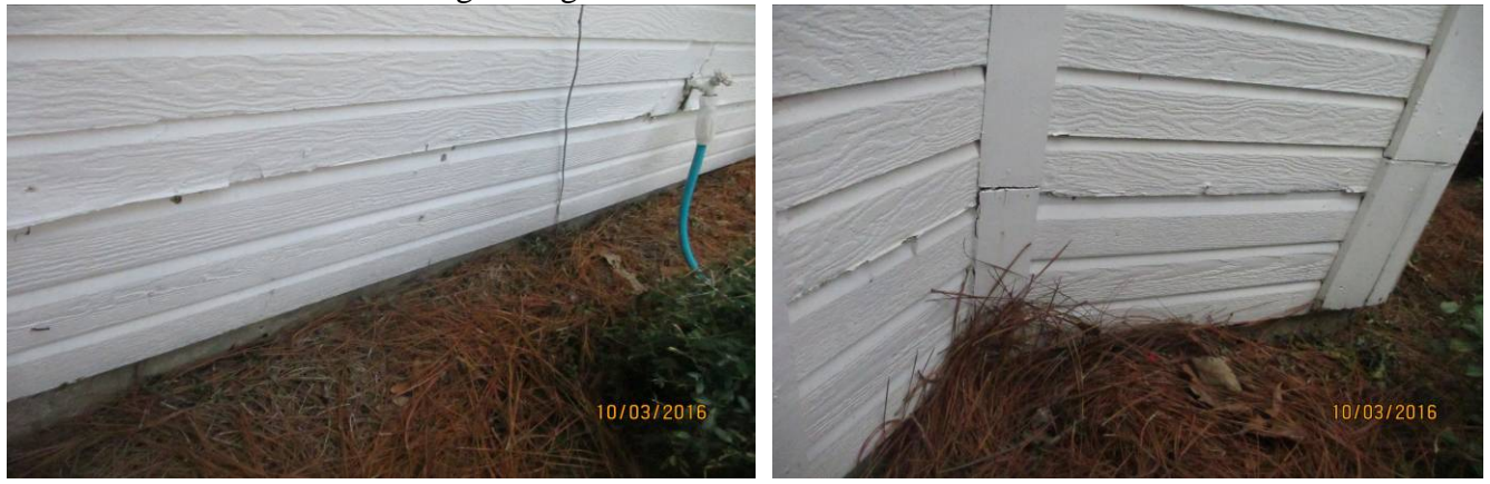
Siding damage on each side of the breakfast nook.

1. There are several areas of water damaged siding and trim.