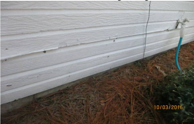
Siding damage on each side of the breakfast nook.